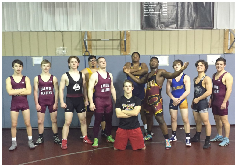
Varsity Wrestling team is ready to compete.