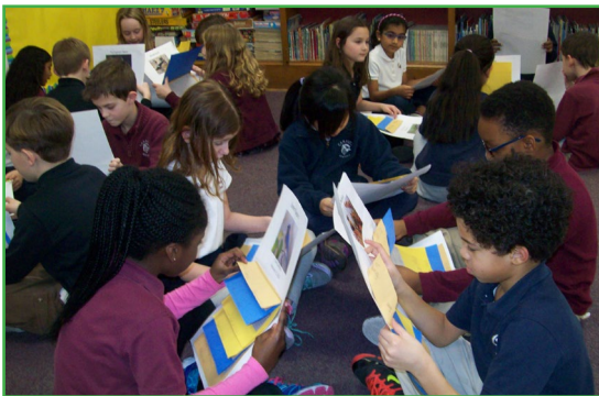
The bird project includes intensive research.