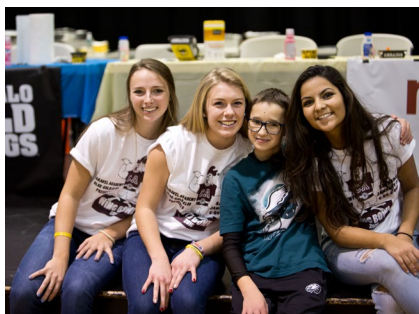
The first annual Wing Bowl raised $2000 for DFRC (Delaware Foundation for Reaching Citizens).