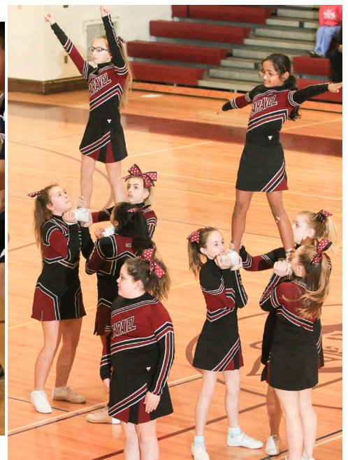
Middle school cheerleaders perform at the boys basketball games.