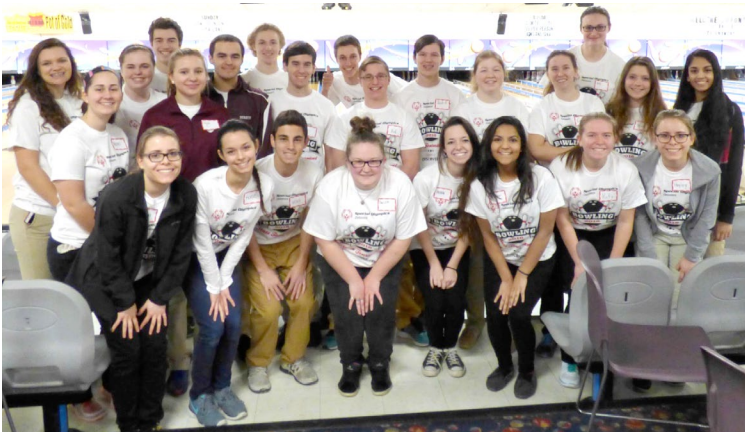
CSG volunteers attend the Special Olympics bowling event.