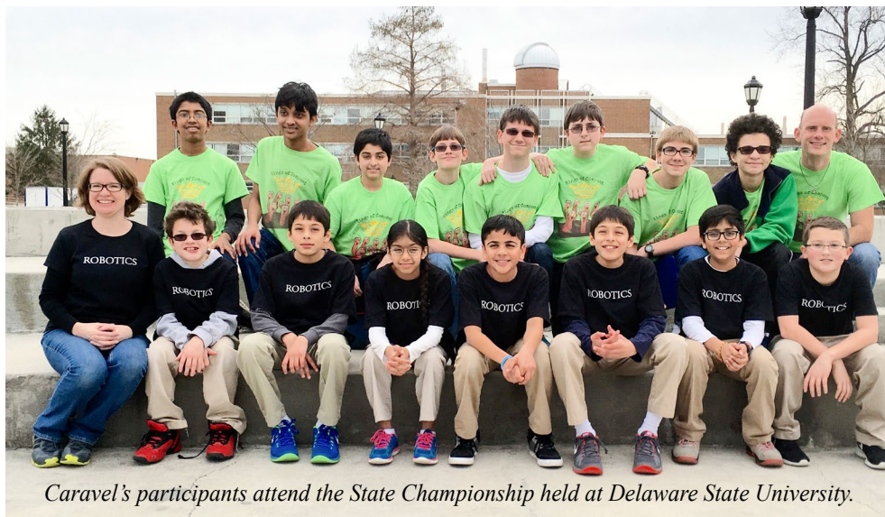
Caravel’s participants attend the State Championship held at Delaware State University.

The sixth grade “Dream Team” was also invited to the State Championship thanks to the “Innovative Solution” that earned them a trophy at the Regional Qualifiers. You may already know that Styrofoam is a material that cannot be recycled in the DSWA single-stream process. But did you also know that meal worms eat it up?! When the sixth grade team first learned this, a few of their faces lit up with sly smiles and the “What ifs...?” began... They studied the possibilities, acquired worms for demonstration, proved their theory, and even attended a lab study to evaluate any potential harm it may cause the worms – the results of which I am led to believe, for all of