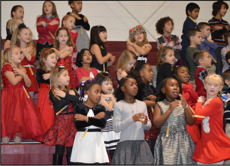
First Grade sings "Just Be Claus"