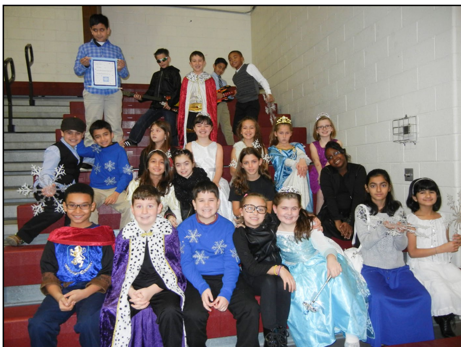
Fourth graders take the parts of the cast in the story.