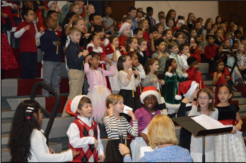
Second Grade sings "Santa is My Buddy"