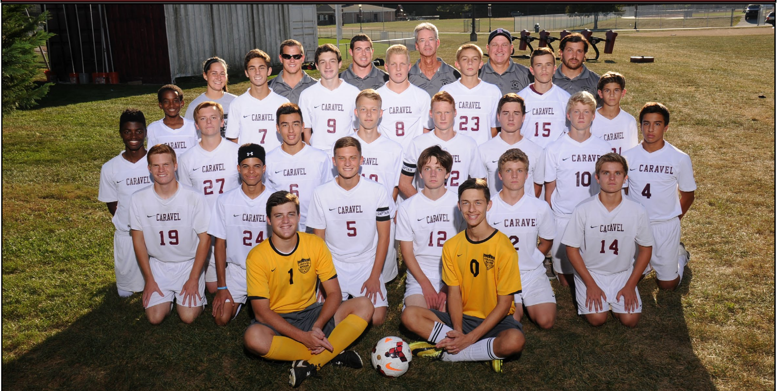
The Bucs finished the season with a 14 - 4 record and a trip to the finals in the DIAA State Championship game against Indian River.