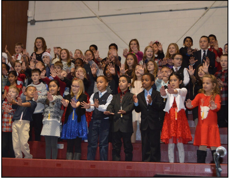
Third Grade sings "Everlasting Fruitcake"