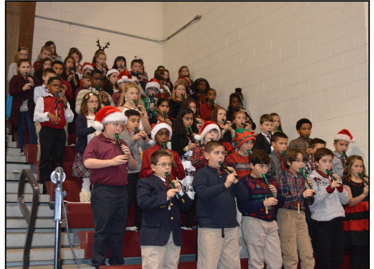
Fourth Grade plays "Little Drummer BAG"